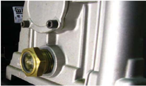
Conventional Sight Glass from A company Unable to see oil level